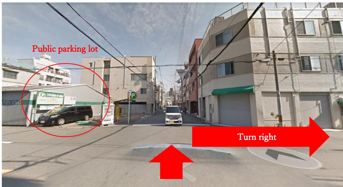
③ Keep going straight and turn right on the first crossroads that has public parking lot at the corner.