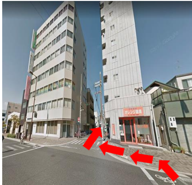
② Go straight and cross the street. Turn right between the 2 buildings.