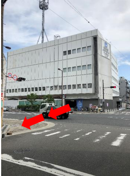
① Please exit from exit No.2.

Approximately 3 minutes of walk by google map