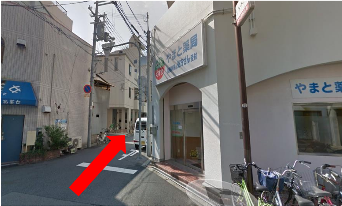
⑤ Turn right when you see “やまと薬局” (drug store).